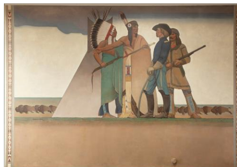
"Bureau of Indian Affairs: Indian & Soldier," by Maynard Dixon (public domain)

If you are researching a Native American ancestor, be sure to not overlook military records. Let's take a look at a few types of Military records available and where to find them. They are service records, court case files, headstone records, and pension records.